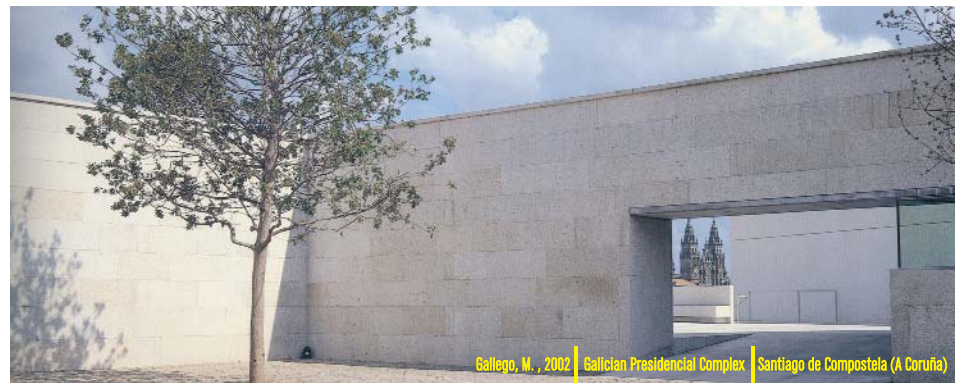
Gallego, M., 2002 | Galician Presidential Complex | Santiago de Compostela (A Coruña)

Granite offers a wide range of innovative, resistant, and long-lasting state-of-the-art systems for fixing clamps; providing, furthermore, insulation which in turn saves on overall costs for thermal control and insulation. Its resistance and sturdiness is a guarantee against external aggressions in such that it forever retains its simple, sober, yet elegant, design. It presents a very homogeneous composition and comes in multiple textures and varieties, adapting itself to any contemporary architectural use or project.