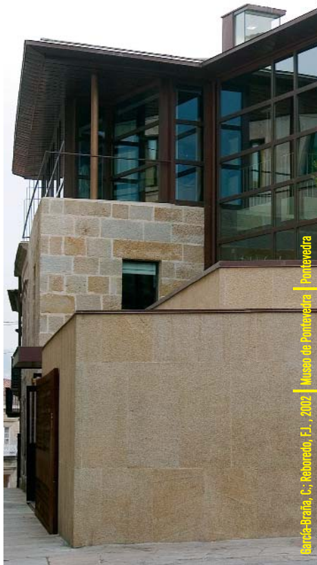
García-Bratón, C., Raboredo, F.L., 2002 | Museo de Pontevedra | Pontevedra