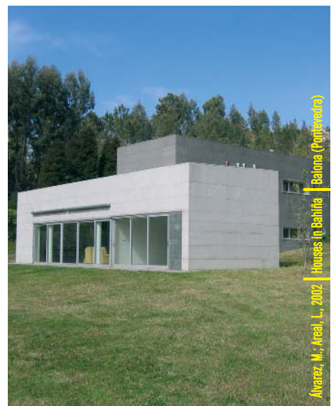
Alvarez, M., Areal, L., 2002 | Houses in Bahiña | Baloma (Pontevedra)

In the most demanding markets worldwide there are examples of the architectural development of granite exported from Galicia; proof of which are works such as Tokyo's City Hall, the Paris Underground, the Museum of Shanghai or the Council of Europe Building, among others.